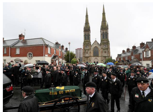
The coffin of former Provisional IRA leader Billy McKee leaves St Peter’s Cathedral, Belfast

From this information we may draw certain sad and alarming and instructive conclusions!